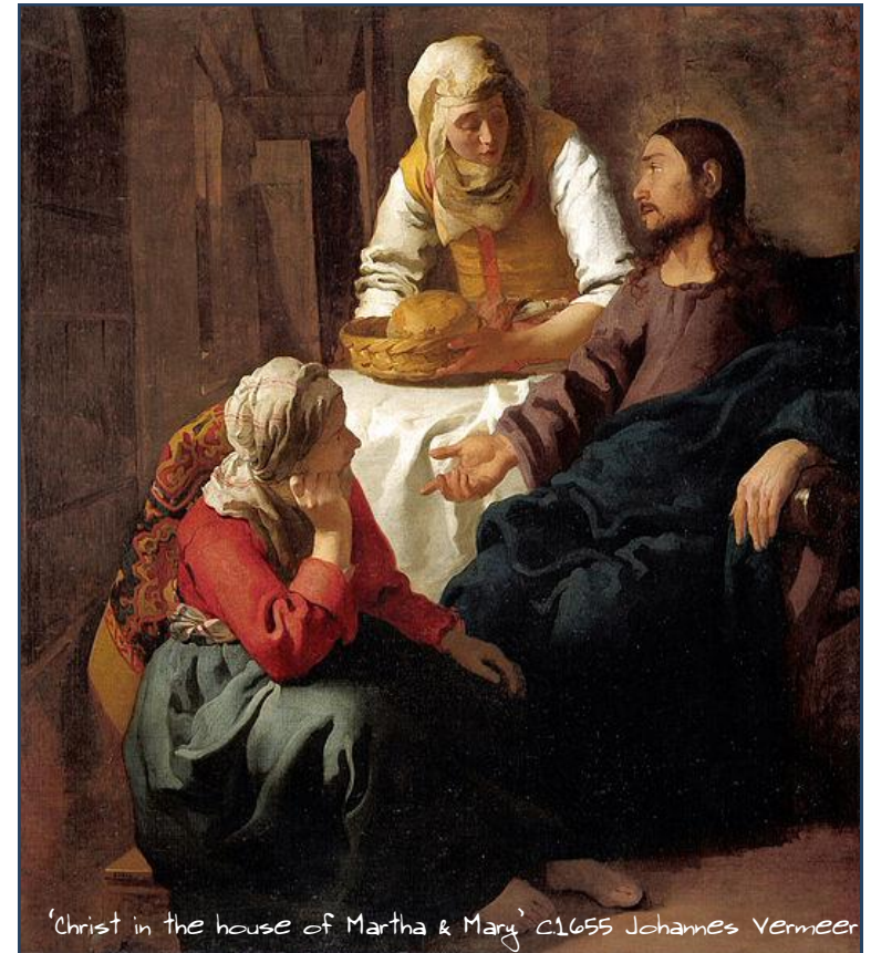
'Christ in the house of Martha & Mary' c1655 Johannes Vermeer

Spread the word: St. Martin's Episcopal School is enrolling children 18 months - 5 years for Fall 2018. Tell your friends and neighbors! More info: stmartinepiscopalschool.org , or grab a brochure and enrollment packet in the back of church. Share on Facebook - referrals will earn you $50 credit on your child's enrollment!