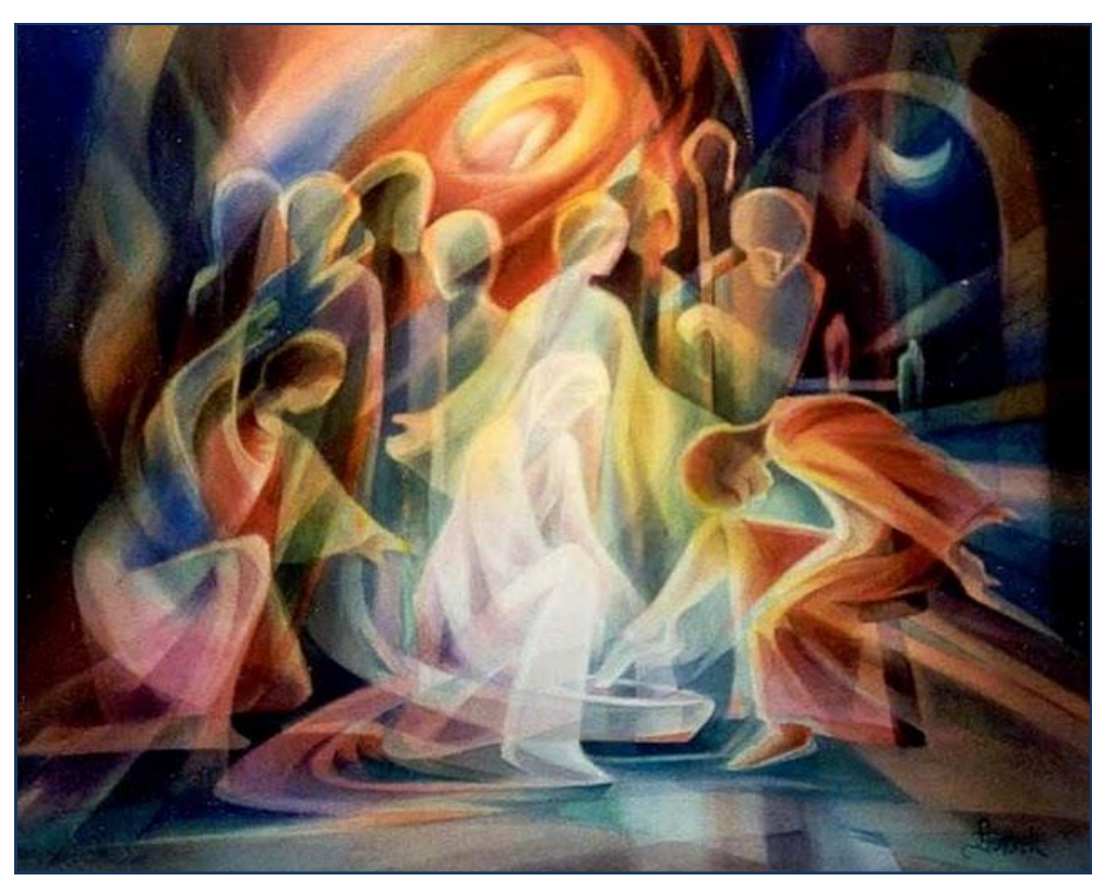
st. martin-in-the-fields episcopal church

our mission is to be Jesus Christ's heart, hands and feet to our neighbors no matter where they are on their journey of faith.