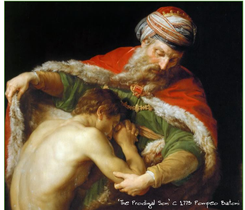
'The Prodigal Son' c. 1773 Pompeo Batoni